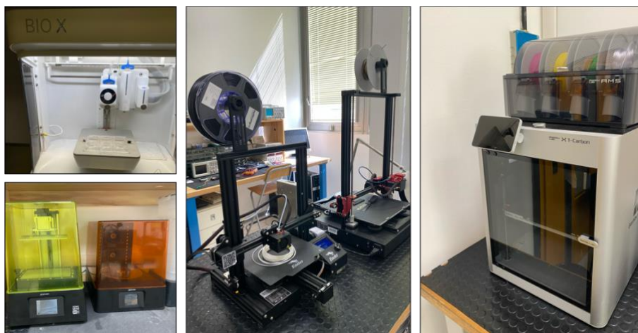
Figure 2. Photos of the available 3D bioprinter and 3D printers.